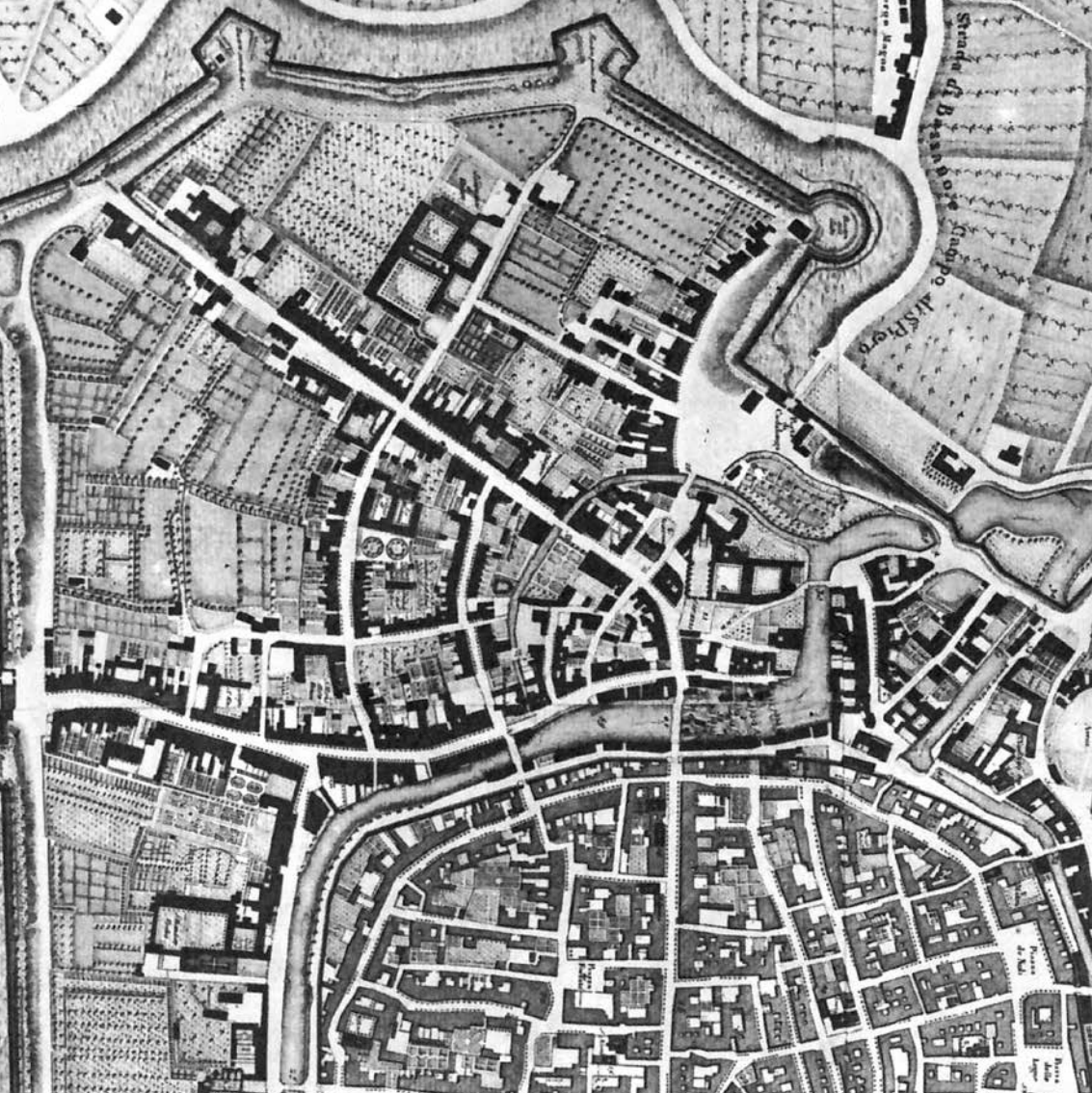
From the book La città di Padova. Saggio di analisi urbana (1970)